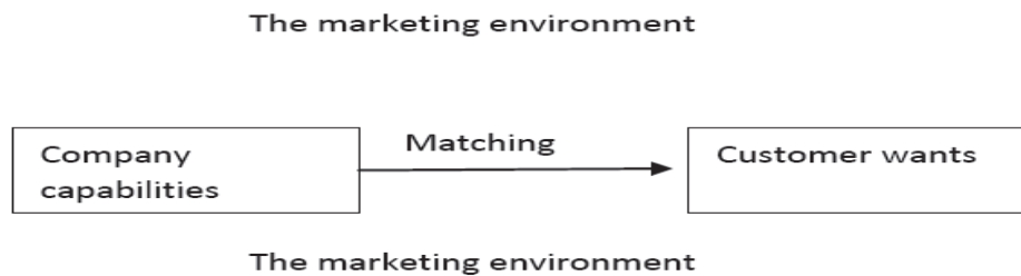
Fig 2. The process of fulfilling the customer needs influenced by the marketing environment

“perform flatters” to purchaser. Conclude deals , by stimulating possible client to purchase the product. Few sellers have the ability to stages 1-5, but find this phase as challenging. Follow up , this is not necessary in all situations, but in case if the product is expensive and, maybe, requires transport and installation, then an information call of consumer can help to provide repeated purchase in the future. If there is no call, a client can take it that interest of sale personnel to extend/long only for one sale, and this has no chance to encourage him to repeat the purchase. After all, personal effective sale have to do with also around developing relationship with clients.